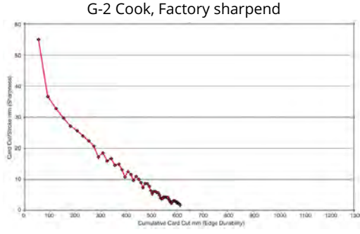
CATRA Cutting Test to ISO 8442.5